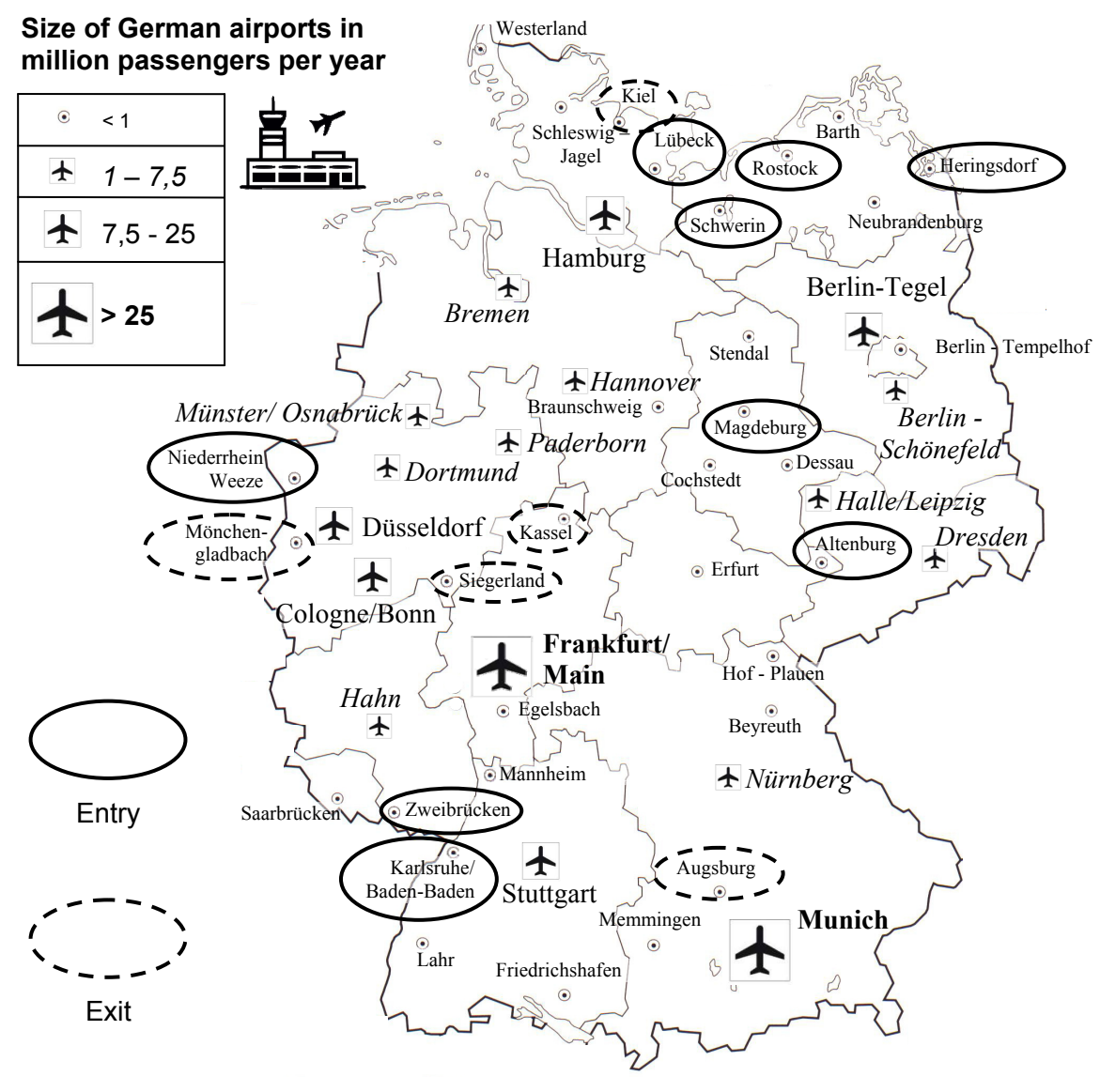
Figure 2: Entry and exit of German airports